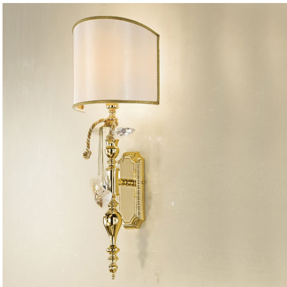
VE 1002 A1