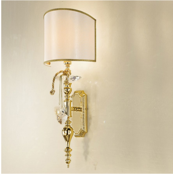
VE 1002 A1